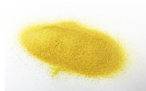
Powdered Propolis extract