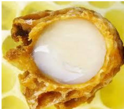
Queen Larvae surrounded by Royal Jelly