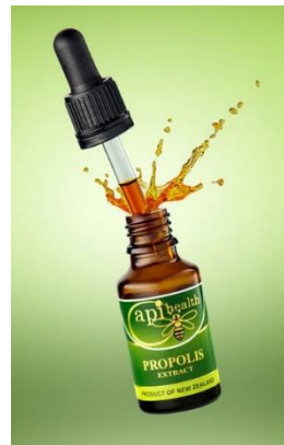
Propolis Liquid Extract