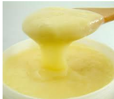
Liquid raw Royal Jelly