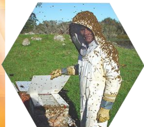
Bee venom collection from bees

ApiHealth Trade Mark VENZ™, is a quality mark that represents unique properties of New Zealand bee venom and technology of its collection.