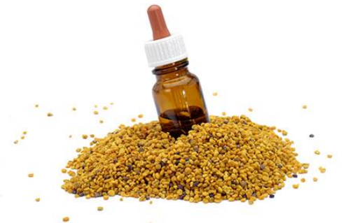
Bee Pollen extract