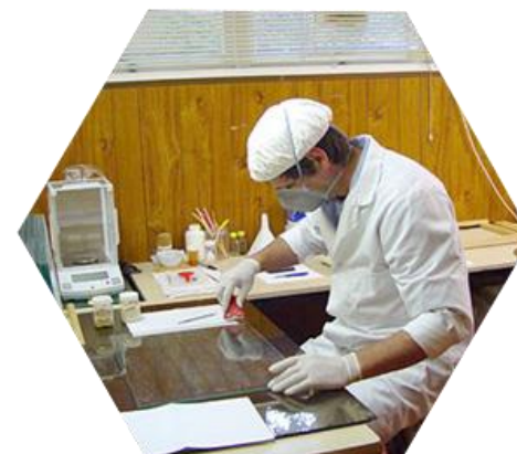
Process of bee venom scratching