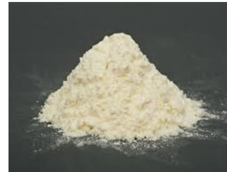
Royal Jelly powder